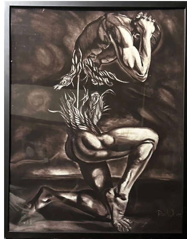
Ron White Stress Summit Artspace