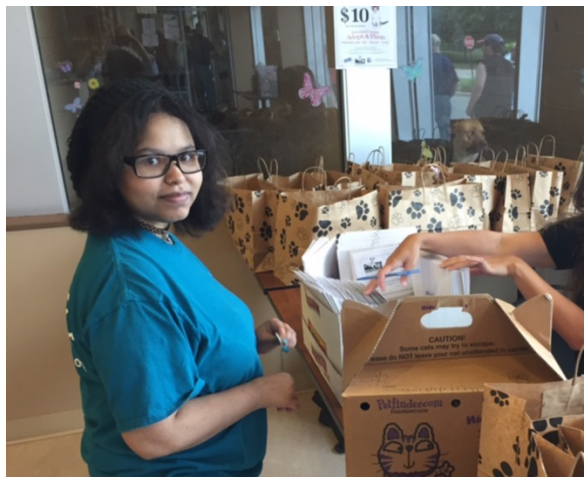
Summit County Division of Animal Control staff and volunteers participate in the Adopt-a-Thon on Saturday, July 15, 2017