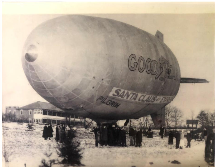
Original Goodyear Blimp.